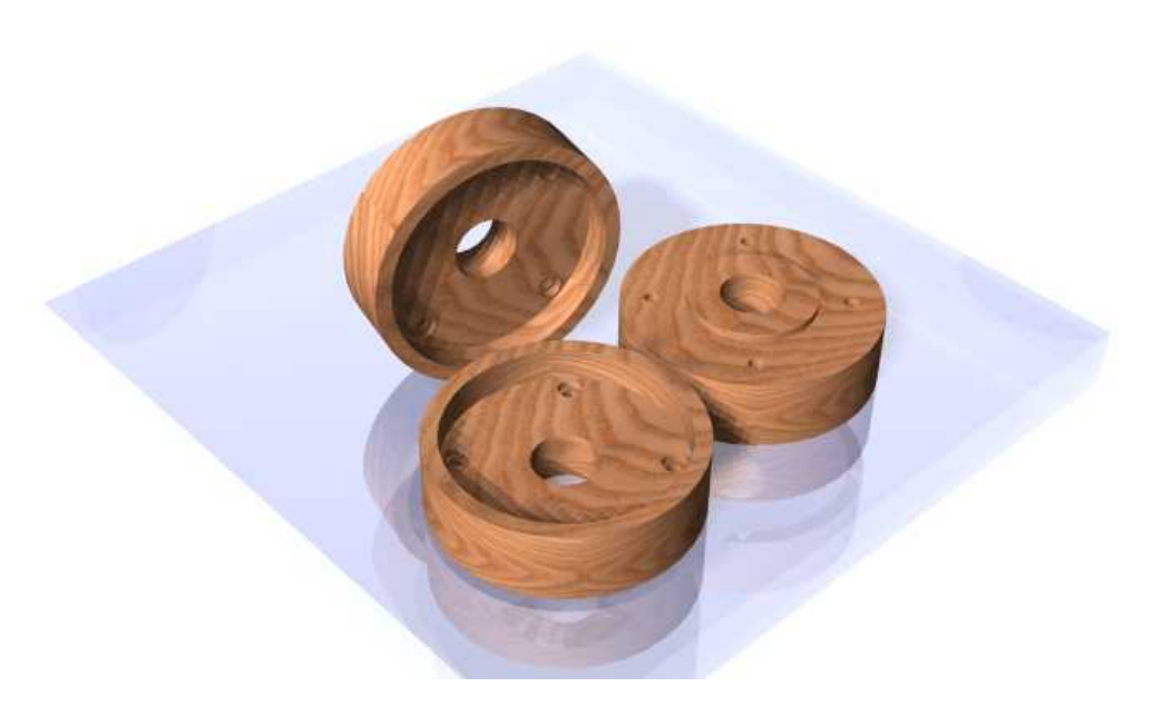
Figure 10.1 - A Marketing Image of a Simple Three Dimensional Part

While the Rectangular, Circular and Bracket problems in the Fundamentals of 2D Drawing pushed you both physically and mentally to create orthographic views of an actual part in the shortest period of time, the number of lines, arcs, circles and text phrases allow for a percentage of error in the result. The difficulty is retaining accuracy from the first view to the second and maybe a third perspective. In a two-dimensional drawing, every entity is a creation of the CAD drafter's ability to use the drawing tools or by modifying an existing object. This creates many opportunities to bring error into your work, since the drawing will contain hundreds of entities and just using a small percentage in the calculation, there may be ten to twenty mistakes in a single drawing just from human error. Since the late 19<sup>th</sup> century, engineering personnel using orthographic drawings have been responsible for allowing more individuals to participate in the industrial and construction process. In the last hundred years, this common language of engineering allowed every level of skilled technician to participate, where in the past the design process was privy just to the master artisan. You could say that the strategic use of placing lines, arcs, circles and dimensions on the x and y-axis is responsible for highly accurate parts and assemblies that can be repeated nearly perfectly in the manufacturing process.