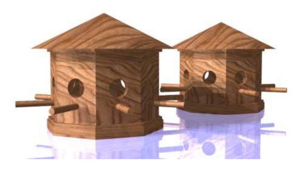
Figure 10.2 - A Marketing Image of a Simple Three Dimensional Assembly

Although the success of the orthographic presentation in Computer-Aided Design process has been monumental, few individuals in the overall population can read a blueprint intelligently. The equalizer in the industry today, which will allow every member of an organization to participate in viewing technical documents, is the introduction of 3D software packages, the amount of Architectural and Engineering companies using 3D presentations and the push in the multimedia industry for 3D graphics. For example, at a local town meeting where an architect presents a new recreational facility, the viewing screen can show a computer model of the pool with life size human figures in the water. Meeting rooms can illustrate simulated session in progress, restroom facilities with a handicap patron at the sink and a weight room displaying each station for exercise and stretching. Seeing the view outside the building, each person in the audience can see a lighted parking lot with small, medium and large size automobiles to examine flow control and safety. The professional host shows every corner of the facility displaying an infinite number of different viewpoints to the public. Every citizen of that locality is able to comment not just on the square footage of the rooms, but be able to see the structure before construction, making the prospect of fund raising easier, and to promote interest