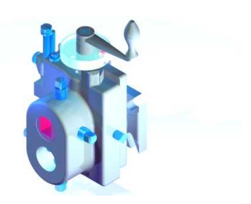
Figure 10.5 - A Marketing Image of a Complex Three Dimensional Assembly to Come

submitted to the World Class CAD team. Your editing time and amount of errors will be calculated, and then the time and score will be posted on the Units' Results webpage. Having the ability to see your name, organization such as school or company, your score and time will allow anyone to place themselves among the world ranking of CAD drafters, designers and degreed professionals.