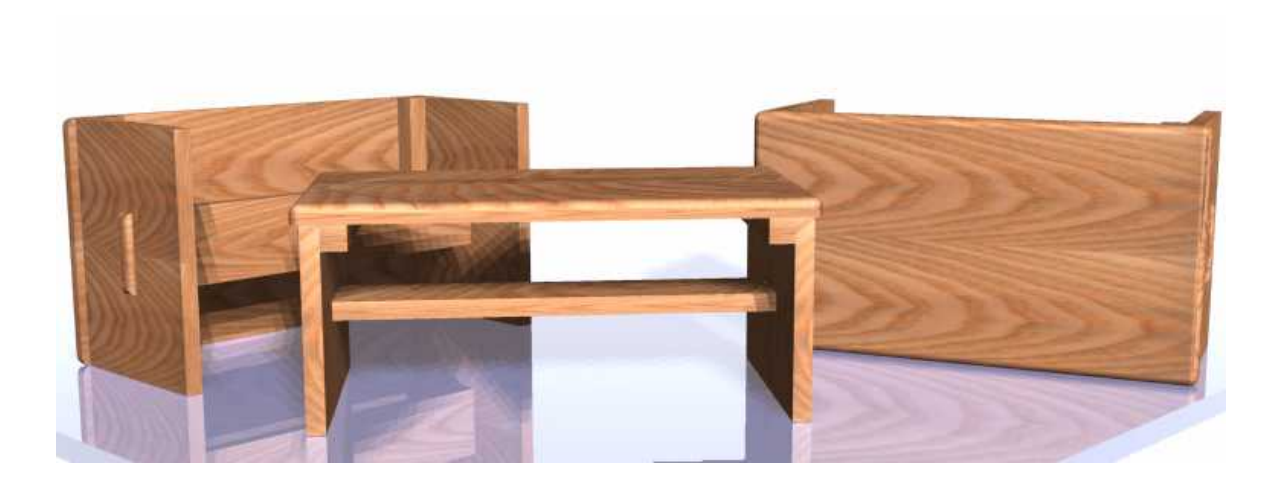
Figure 10.4 - A Marketing Image of your First Simple Three Dimensional Assembly

Students and professionals are amazed at the clarity of the marketing images made for the assembly, the ease of documenting each of the solid parts and orthographic drawings, and the effortlessness of making 3D assembly drawings.