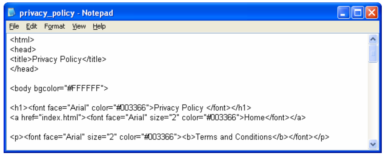
Figure C.9 – Adding Text to the Web Page

In the next line of code, we add the small line of text, Terms and Conditions. We will define the font style, size and color using the color, size and face elements.