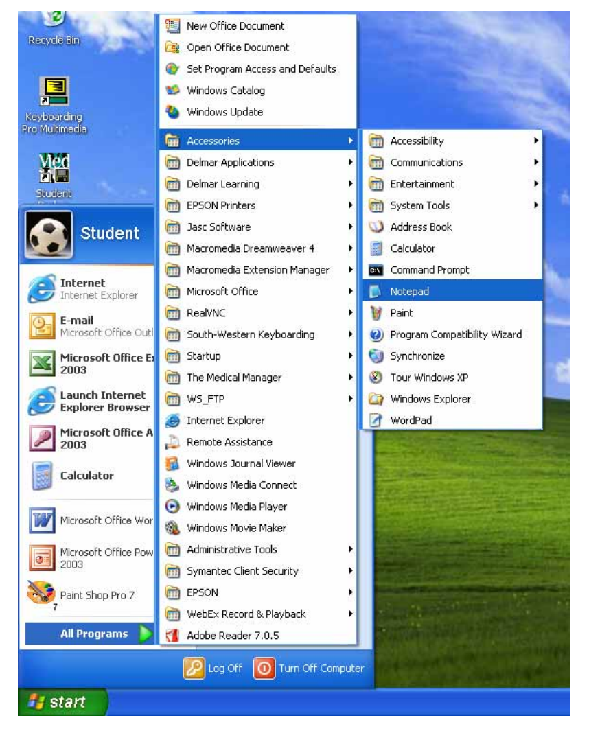
Figure C.1 – Starting Up the Microsoft Notepad Application

Begin by opening up Notepad by clicking the Start button on our desktop and choosing Programs/Accessories/Notepad as shown in Figure C.1.