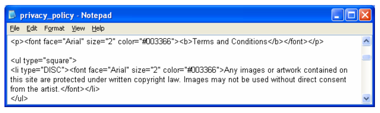
Figure C.10 – Adding a Bulleted List to the Web Page

Sometimes, we will want to have a bulleted list in a web page. The tag defines the bulleted list and the type element allows us to use a square, disc (solid dot) or a circle in front of each bullet. The tag represents each item in the list and we can use the font tag to define the font style and size of the bulleted phrase. We want to refer to Figure C.10 to insert the correct HTML code for the Web Designer's information.