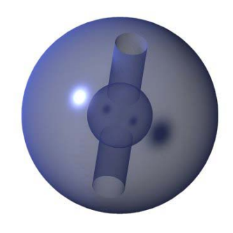
Figure 1.9 – Problem Seven Figure 1.10 – Problem 8