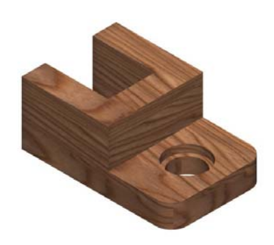
Figure 1.5 – Problem Three

The sixth problem, also drawn in metric, will allow you to use the Rotate3D command to create a unique part. In AutoCAD, many support tools will allow you to move, copy, rotate, align or mirror the solid on the two-dimensional plane. Editing tools like Move, Copy and Align do their jobs outside the 2D plane and are the most flexible in both types of drawing methods. There are special 3D tools accessible primarily for the 3D solid, such as Rotate3D, Mirror3D and 3dArray. Many students find these special commands to be hard to use at first, but with reference to the UCS icon, the tool can be dominated.