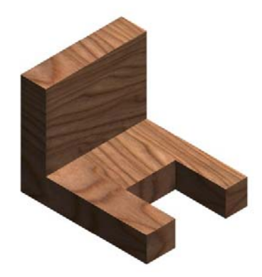
Figure 1.3 – Problem One

The second problem will reinforce the lessons from the first exercise adding a tutorial on the Wedge tool. When you draw a three-dimensional solid in the ten basic training session, you will have a time limit in order to complete the exercise, so you can practice different methods that will achieve the same result. Some designers will draw individual components that bringing together all of the units with the Union tool. Others will create the larger solid, and then place the particles in position that you will subtract from the larger entity. 3D solids that are symmetrical can be made only on one side the centerline and then you will use the Mirror and Union tools to finish the part.