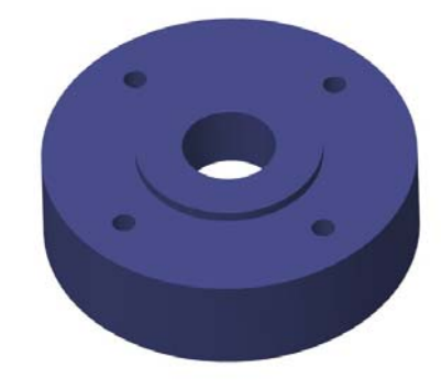
Figure 1.15 – Revolution 3