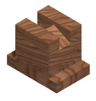
Figure 1.4 – Problem Two