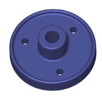
Figure 1.13 – Revolution 1

The three problems in the circular set all deal with the Revolve tool on the Solids. These parts have a hub near the center of the part, where the circular entity attaches to a shaft. There are many parts like this in many assemblies. Knobs, wheels or bases have the hub detail followed by a thinner cross section working towards the outer periphery of the part. Many times, there are clearance holes in the flat expanse for bolts or screws to pass through onto other connecting devices. There can be an outer lip to counter torque in the design or just add an artistic relief.