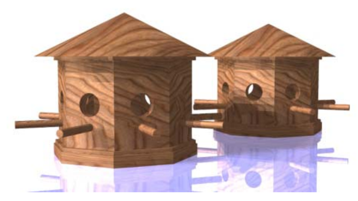
Figure 1.2 – A Marketing Image of a Simple Three Dimensional Assembly

process. In the last hundred years, this common language of engineering allowed every level of skilled technician to participate, where in the past the design process was privy just to the master artisan. You could say that the strategic use of placing lines, arcs, circles and dimensions on the x and y-axis is responsible for highly accurate parts and assemblies that can be repeated nearly perfectly in the manufacturing process.