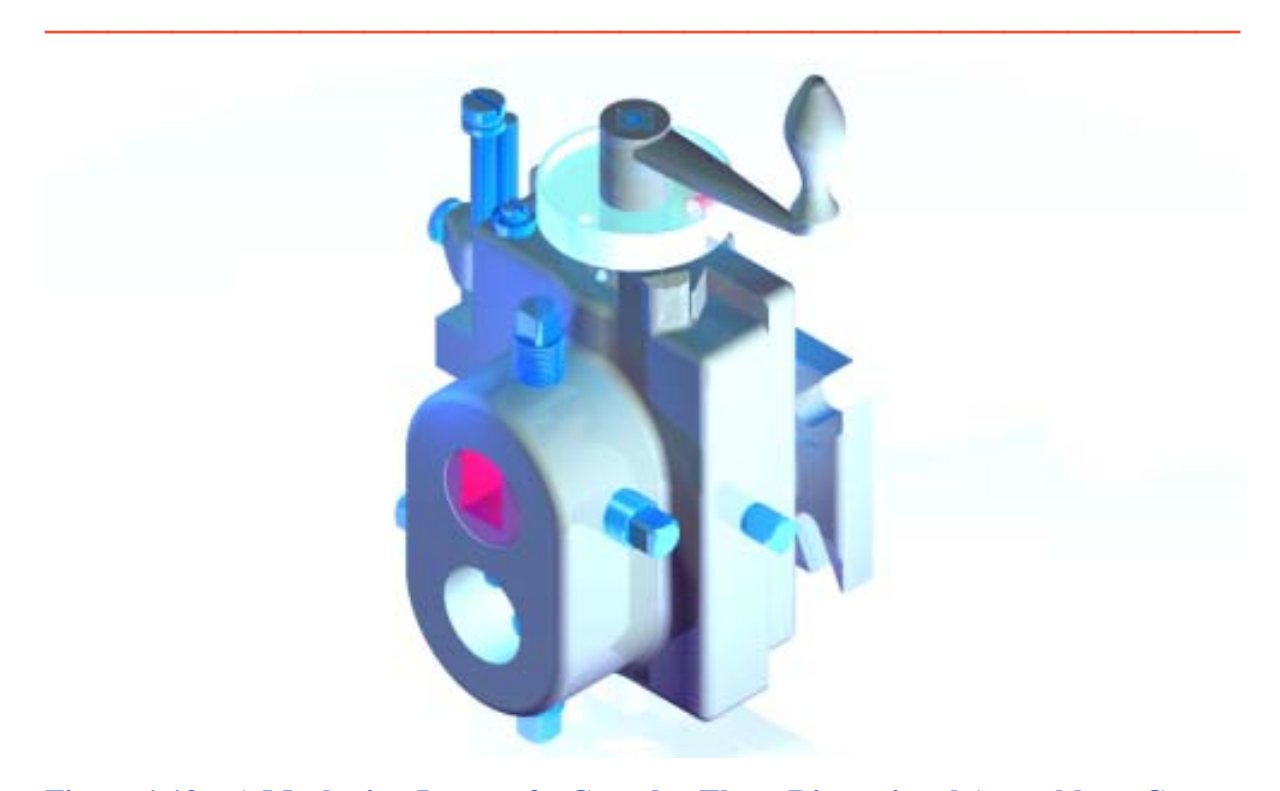
Figure 1.19 – A Marketing Image of a Complex Three Dimensional Assembly to Come

Architects will move to work on house plans in the Residential Architecture text and mechanical designers and engineers will be working on even more complex assemblies in the Basic Mechanical Design manual. The challenges do not get easier, but your reputation among your colleagues and the customers will continue to grow. You can check the list of text in the World Class CAD series of training.