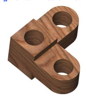
Figure 1.7 – Problem Five