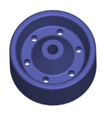
Figure 1.14 – Revolution 2

The last problem in step two has a smaller hub and less detail for the clearance holes on the side shown. The most complex features are on the opposite side of the part, so you have to decide how to draw the solid. The procedure is not hard in AutoCAD, but the sketch in Revolution 3 is opposite in detail than the first two. Determine whether you wish to draw the part upside down to show the additional textures or continue using the exact same method you used in the first two. After saving the thirteen solids, you need to create the thirteen part drawings for each entity in Paper Space.