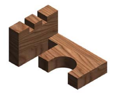
Figure 1.8 – Problem Six