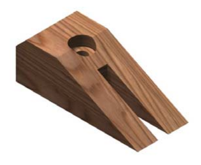
Figure 1.12 – Problem Ten

The tenth problem finishes the set with a composite of different shapes. Now where the first ten parts are rectangular in nature, in the next phase of training, you will do mostly circular solids using the Revolve command. The problems in phase two are different enough in shape to cause most designers to make the majority of the detail using the Revolve command and then remove the finer details using the Subtract tool. When you see a circular problem, consider the newer method shown in step two as your first choice to attack the exercise.