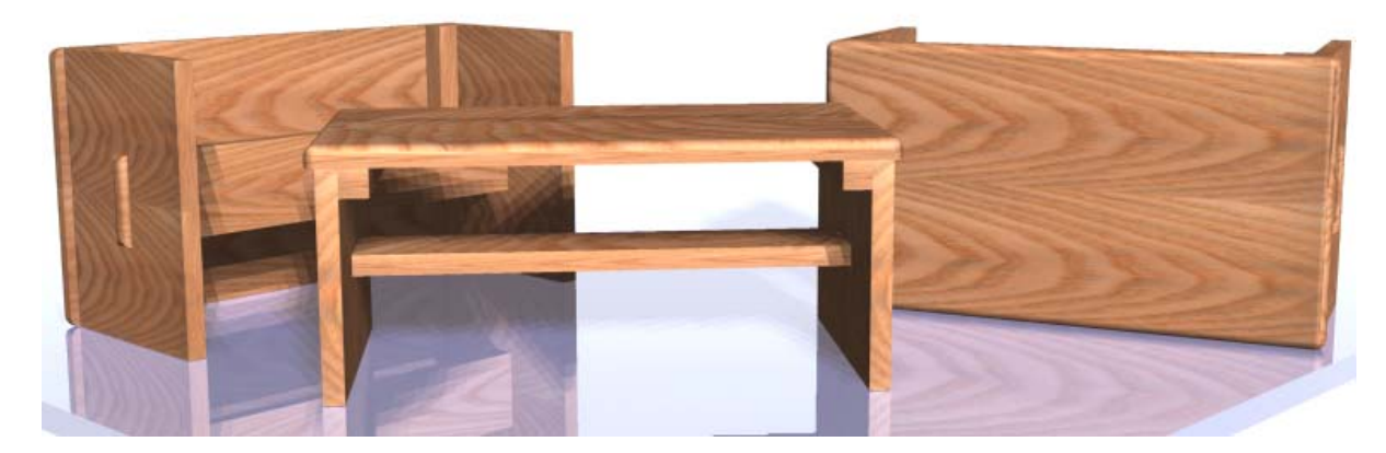
Figure 1.17 – A Marketing Image of your First Simple Three Dimensional Assembly

The last phase of the training involves making simple assemblies for relatively simple part drawings. Your first XREF assembly will be the footstool shown in Figure 1.17. Students and professionals are amazed at the clarity of the marketing images made for the assembly, the ease of documenting each of the solid parts and orthographic drawings, and the effortlessness of making 3D assembly drawings.