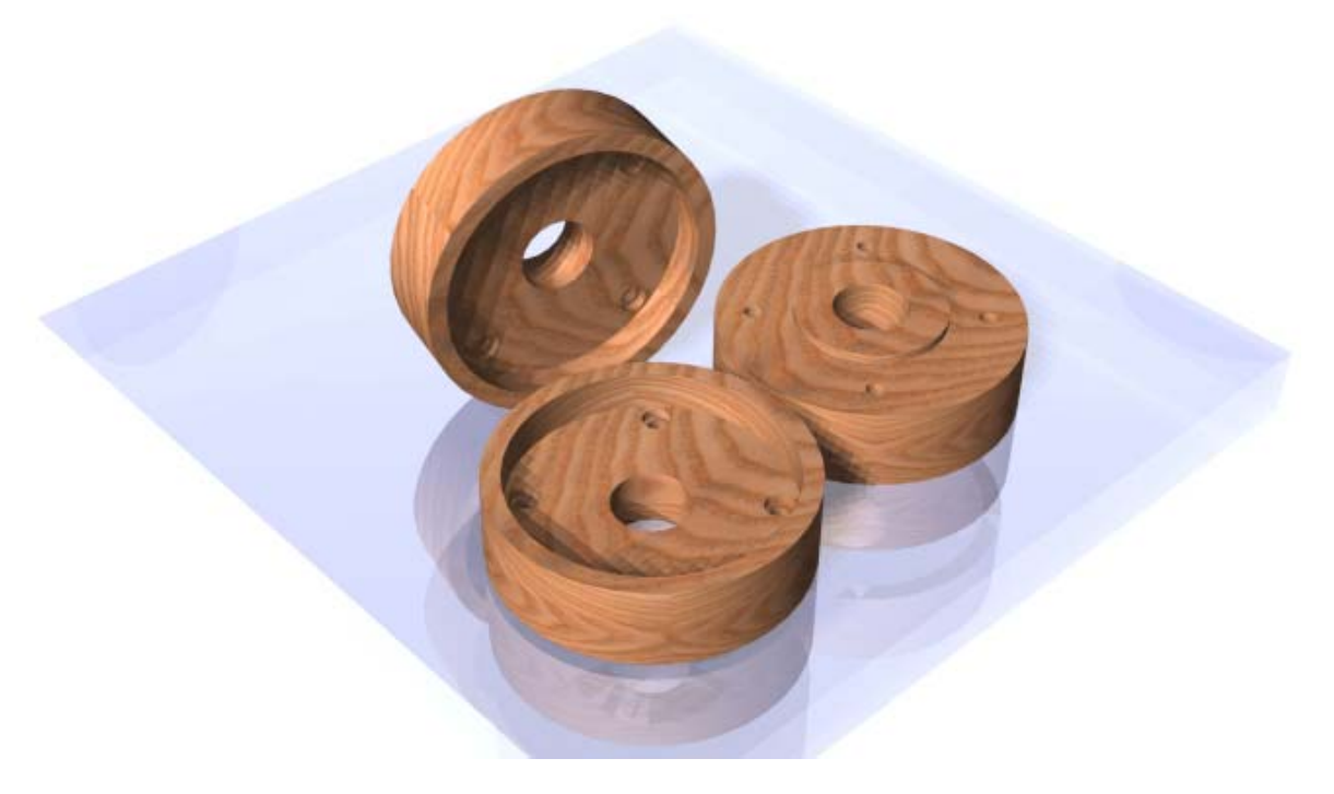
Figure 1.1 – A Marketing Image of a Simple Three Dimensional Part

In the Fundamentals of 2D training, you are examining all the aspects of making an individual part drawing and have repeatedly practiced the skills that enable you to a make a computer aided design project quickly. Although the engineering drawing is the primary product coming out of the modern Architectural and Manufacturing firms, companies have and are in process of moving towards the world of three-dimensional designs. The advantage of 3D over the 2D technique is largely that in the past, the intent would be to build a prototype or scaled model of the project to discover any mechanical problem such as an interference fit or an artistic flaw such as texture, curvature or color. With the present software engines like AutoCAD, Microstation, Pro Engineer, Solid Works or CATIA, parts and assemblies, specialist are scrutinizing in very close detail to determine whether they meet the customer's specification. For the professional of the 21<sup>st</sup> century, 3D design will be the cornerstone to laying a successful foundation in the innovative process.