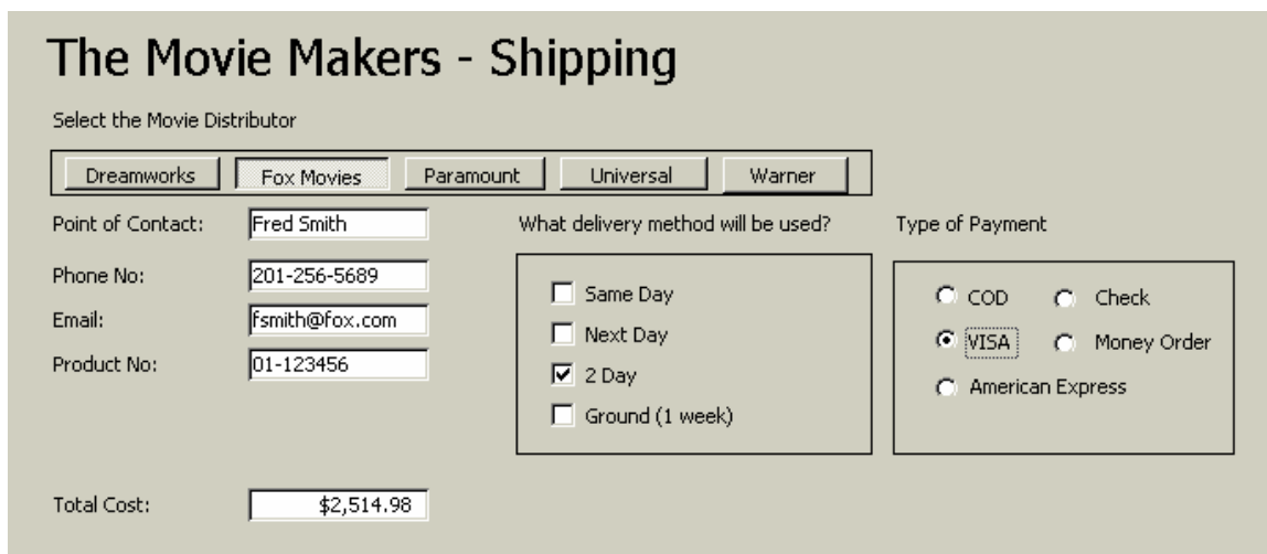
Figure 1.6 – Advanced Form 6

Create a form that allows you to add records to the table. Save the form as frmShipping