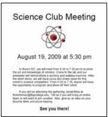
An Example of a Microsoft Word Exercise