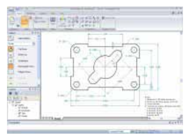
2D Drawing made with Siemens Solid Edge Software

World Class CAD released the new <u>2D Drawing with Solid Edge</u> online book this year. The chapters are available free online and are easily accessible on the main World Class CAD homepage.