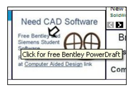
Receive a WCC Certificate

free download of the PowerDraft CAD software.